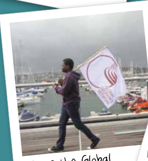
Flying the Global Geopark Flag