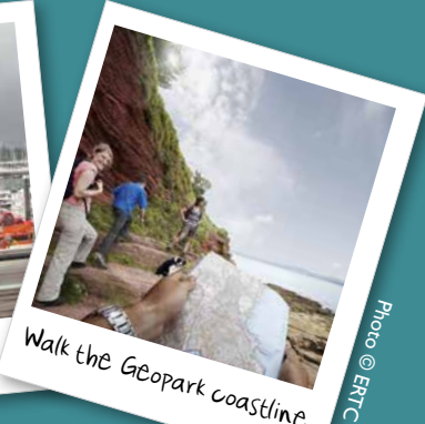
Walk the Geopark coastline