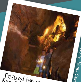
Festival fun at Kents Cavern

Geopark sightseeing cruises running everyday for further information call Paignton Pleasure Cruises on 01803 529147 or 07768 014 174 or Greenway Ferry on 01803 882811 plus Arts and Crafts, Kayaking, Trails and much more.