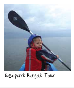
Geopark Kayak Tour